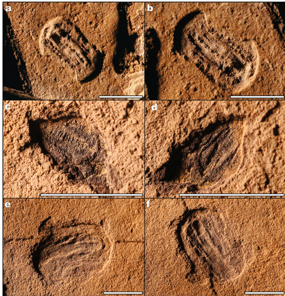
Figure 3. Specimens of Kimberella persii n.sp. from the Kushk Series, Chahmir area. (a,b) Specimen Ch/14/62, (c,d) specimen Ch/14/49a, (e,f) specimen Ch/14/49b. Scale bars: 1 cm.

of a small, goblet- to oval-shaped form preserved in negative epirelief with distinct rows of round protrusions, which originally represented external openings later infilled with sediment 37,38 . The overall columnar shape with distinct incurrent pores is suggestive of a poriferan-grade organism capable of effective filter feeding, however in the absence of siliceous or carbonaceous spicules, it is difficult to assign this species to an existing clade.