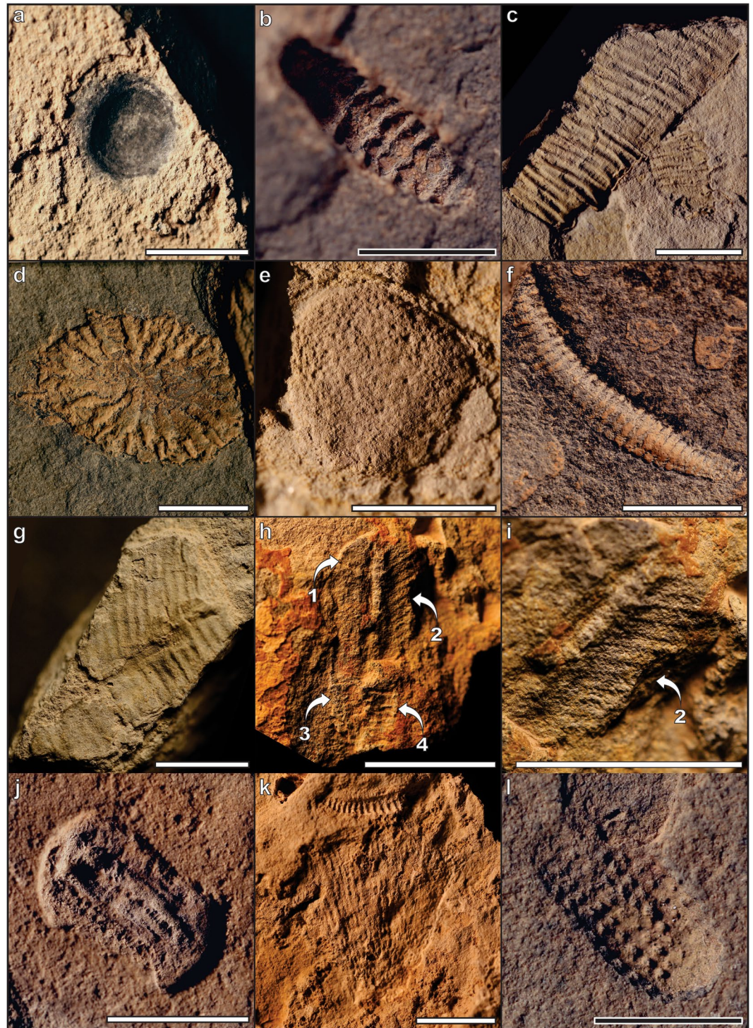
Figure 2. Ediacaran fossils from the Kushk Series, Kushk and Chahmir areas. (a) Organic-walled Chuaria (Ku/14/49), (b) Cloudina (deep negative impression, Ku/14/03a), (c) Corumbella (Ch/14/47), (d) Persimedesites chahgazensis (Ku/14/01), (e) Kuckaraukia (Ch/14/30), (f) unknown tubular organism (Ku/14/09a), (g) Erniettomorph (Ku/14/67), (h,i) Rangeomorph with at least 4 petaloid leaves (1-4) (Ku/14/15), (j) Kimberella persii n.sp. (Ch/14/62), (k) Possible trace fossil Radulichnus (Ku/14/114), (l) Gibbavasis kushkii n.sp. (Ch/14/56a). White (1 cm) and black (0.5 cm) scale bars.

different sediment heights are found within the impression, implying differences in tissue lability and structural rigidity. Kimberella persii n.sp. shares the implied tissue differentiation and segmentation typical of Kimberella quadrata , however lacks the organic frill that outlines the periphery of the implied organic dorsal shell 36 (Fig. 3). These characters suggest a bilaterian (stem mollusc) affinity 36 . Gibbavasis kushkii n.sp. (n = 9; Figs 2i, 4) consists