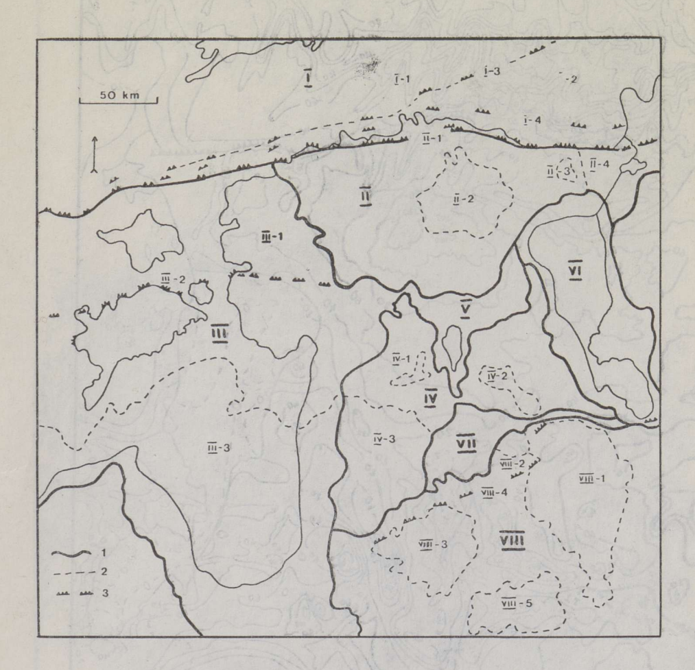
Fig. 2. Main forms of Estonian and North-Latvian bedrock topography. I depression of the Gulf of Finland: 1 Sub-Vendian and 2 Cambrian-Vendian plains, 3 Vendian and 4 Cambrian escarpments; II Viru-Harju Plateau: 1 Ordovician escarpment, 2 Pandivere Upland, 3 Ahtme Eminence, 4 Narva-Luuga Lowland; III Livonian Lowland: 1 West-Estonian Lowland, 2 Silurian escarpment, 3 depression of the Gulf of Riga; IV Middle-Devonian Plateau: 1 South-Sakala Upland, 2 North-Vidzeme Lowland; V Central-Estonian Lowland; VI depression of Lake Peipsi; VII Valga and Southeast-Estonian lowlands; VIII Upper-Devonian Plateau: 1 Haanja-Aluksne Heights, 2 Karula Upland, 3 Vidzeme Heights, 4 Devonian escarpment, 5 East-Latvian Lowland.