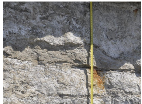
Fig. 6.3. Soft-sediment deformations (load casts and flame structures, Põldsaar & Ainsaar 2014) in the Pakri Formation, Kunda Regional Stage.