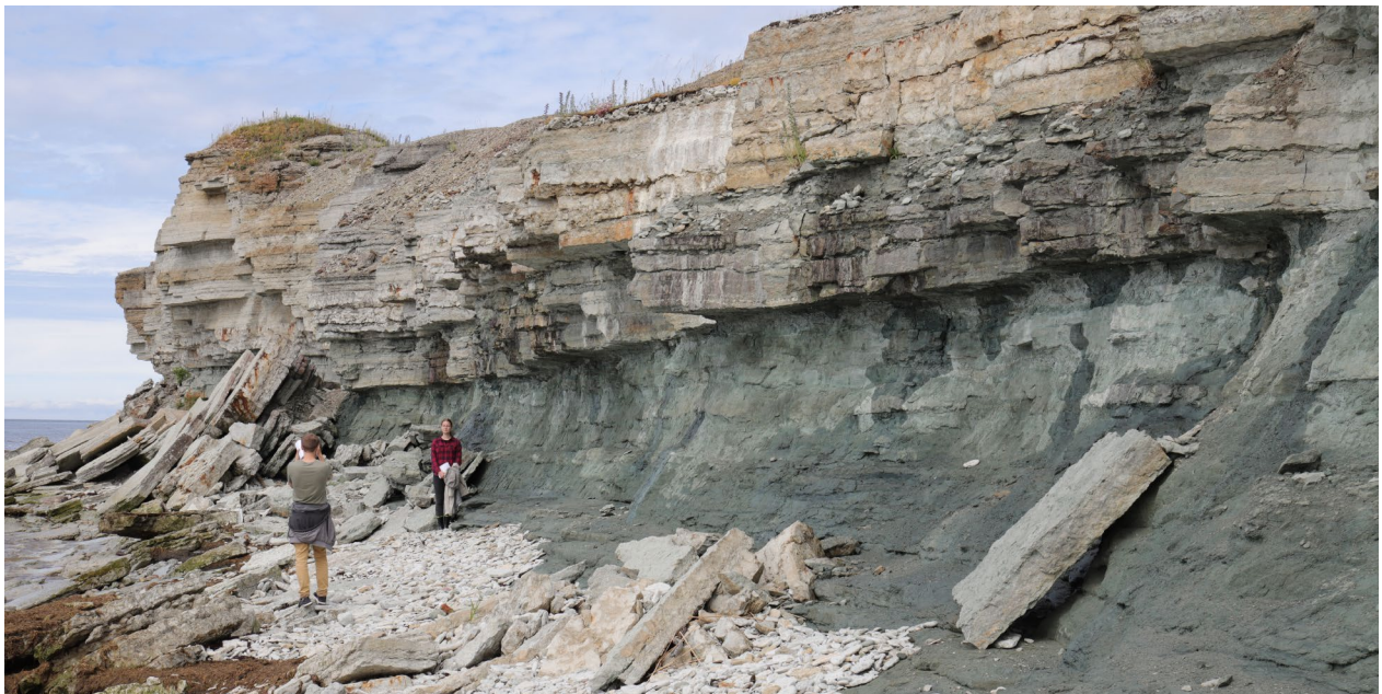
Fig. 6.1. Succession of Tremadocian-Floian glauconitic sandstone (Leetse Formation) and Dapingian-Darriwilian carbonate rocks at the Uuga cliff near the Northern Port of Paldiski.

The Pakri Formation, Kunda Regional Stage, lower Darriwilian, is characterised by sandy limestones to calcareous sandstones with soft-sediment deformations (Fig. 6.3).