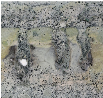
Fig. 6.2. A characteristic hardground (“Püstakihit”) at the base of the Volkhov Regional Stage (coinciding with the base of the Dapingian). The same surface with Gastrochaenolites borings can be traced from NW Russia to Öland Island, Sweden. Left – outcrop photo, right – polished slab GIT 362-538.