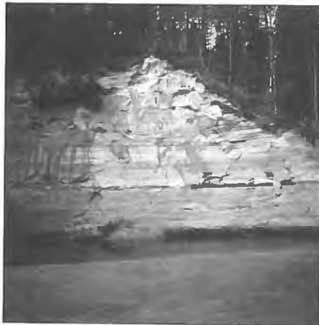
Suur-Taevaskoda outcrop, sampling site of Es-5.